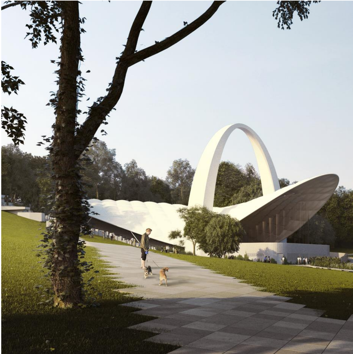
Szczecin Summer Theatre, London, United Kingdom, by Flanagan Lawrence