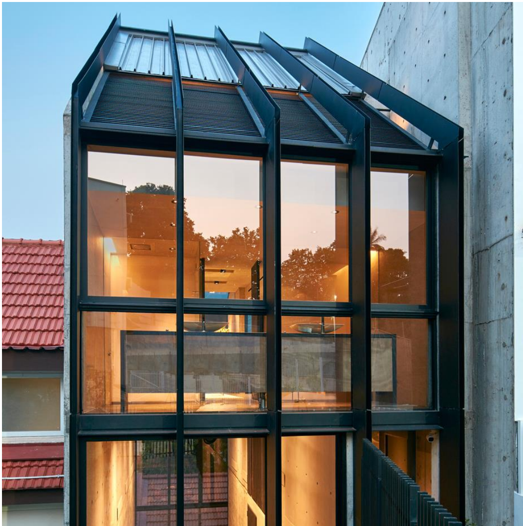
Niven Road Studio, Singapore, by WOW Architects and Warner Wong Design