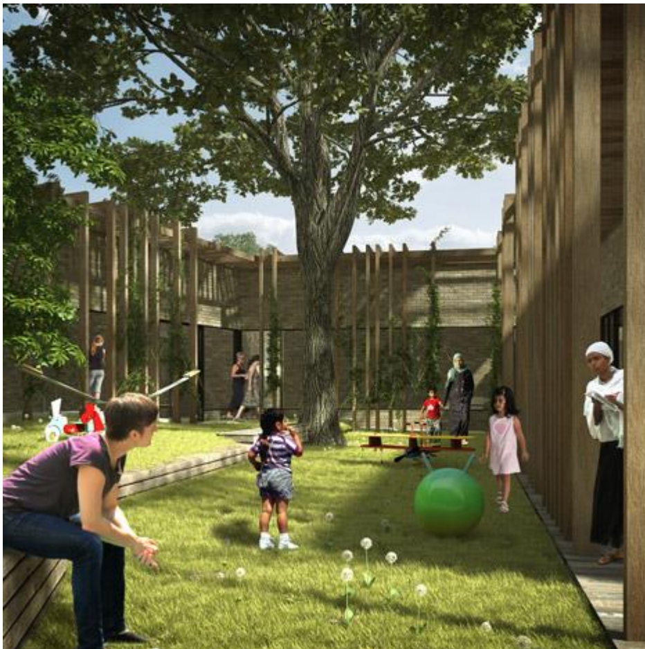
Shelter for Battered Women, Israel, by Amos Goldreich Architecture