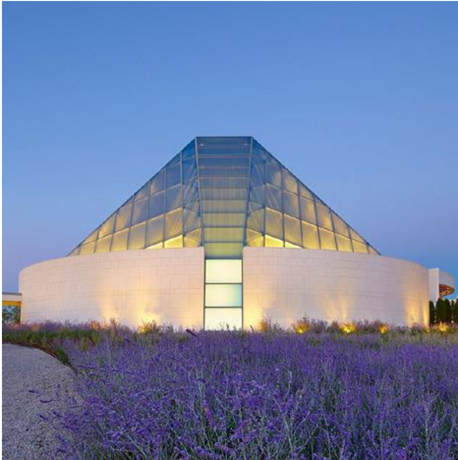
Aga Khan Park, Toronto, Canada, by Vladimir Djurovic Landscape Architecture