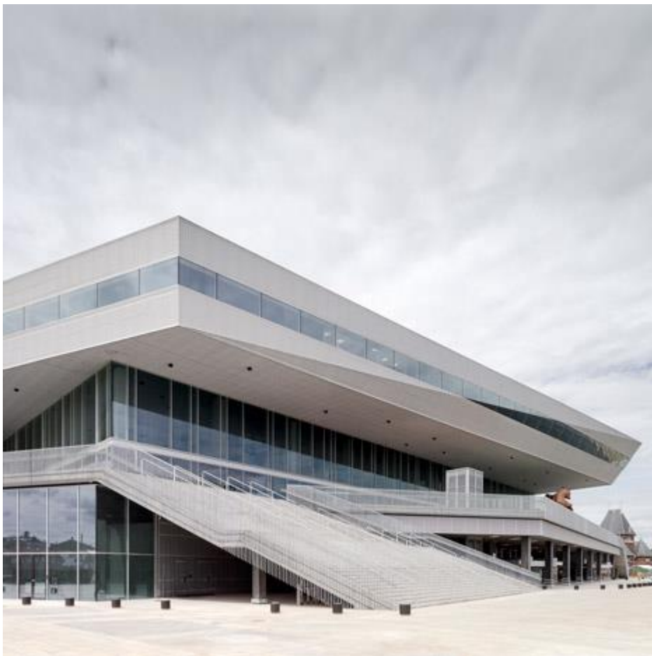
Dokk1, Aarhus, Denmark, by Schmidt Hammer Lassen Architects