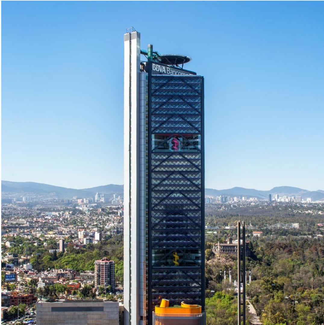
Torre BBVA Bancomer, Mexico City, Mexico, by Rogers Stirk Harbour and Partners and Legorreta + Legorreta