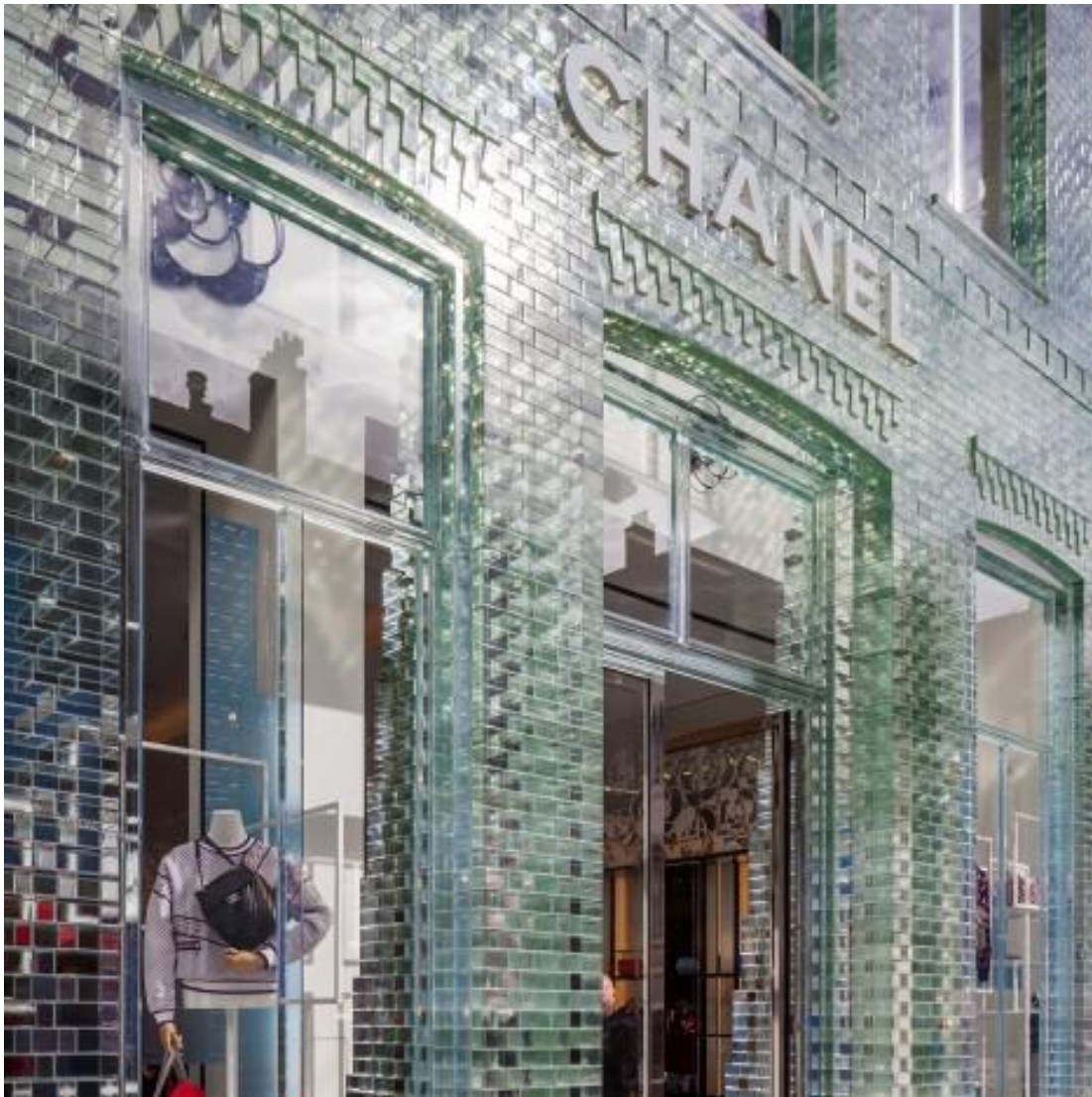
Crystal Houses, Amsterdam, Netherlands, by MVRDV