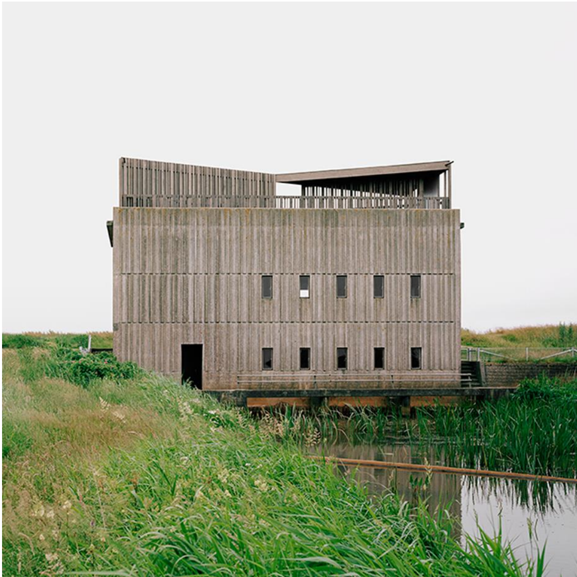
Skjern River Pump Stations, Denmark, by Johansen Skovsted Arkitekter