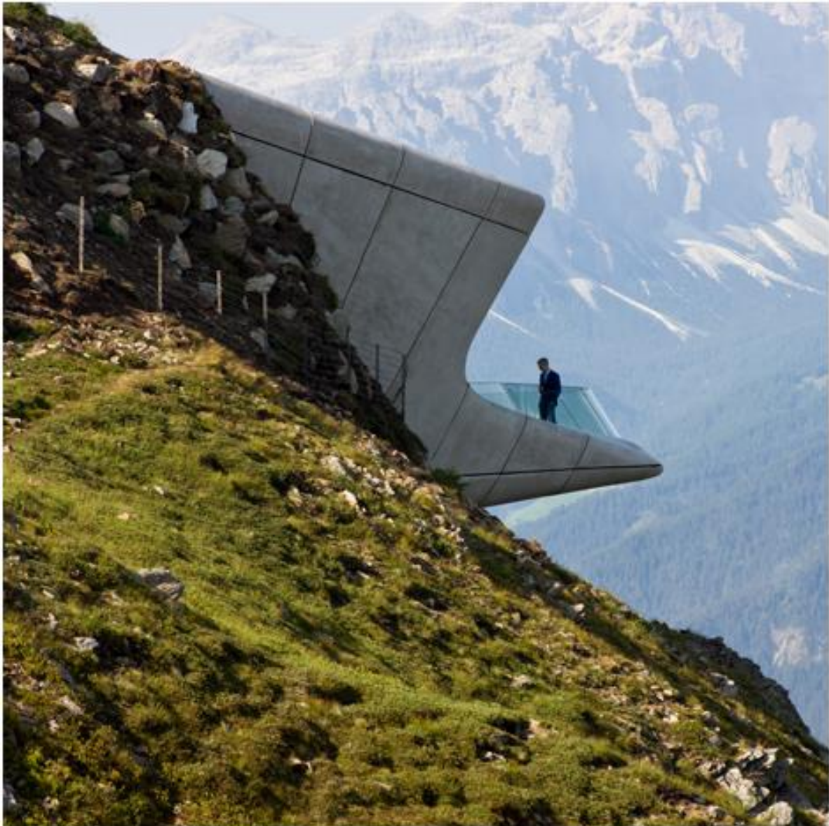
Messner Mountain Museum, Corones, Kronplatz, South Tyrol, Italy, by Zaha Hadid Architects

Winners will be selected from across 32 categories and announced during the festival. One project will go on to win the coveted World Building of the Year title, and another will be named Future Project of the Year.