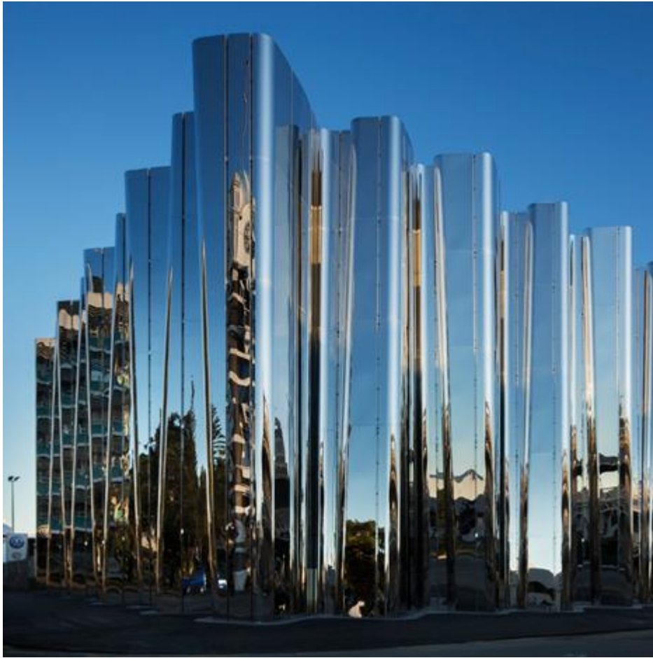
Len Lye Centre, Taranaki, New Plymouth, New Zealand, by Patterson Associates