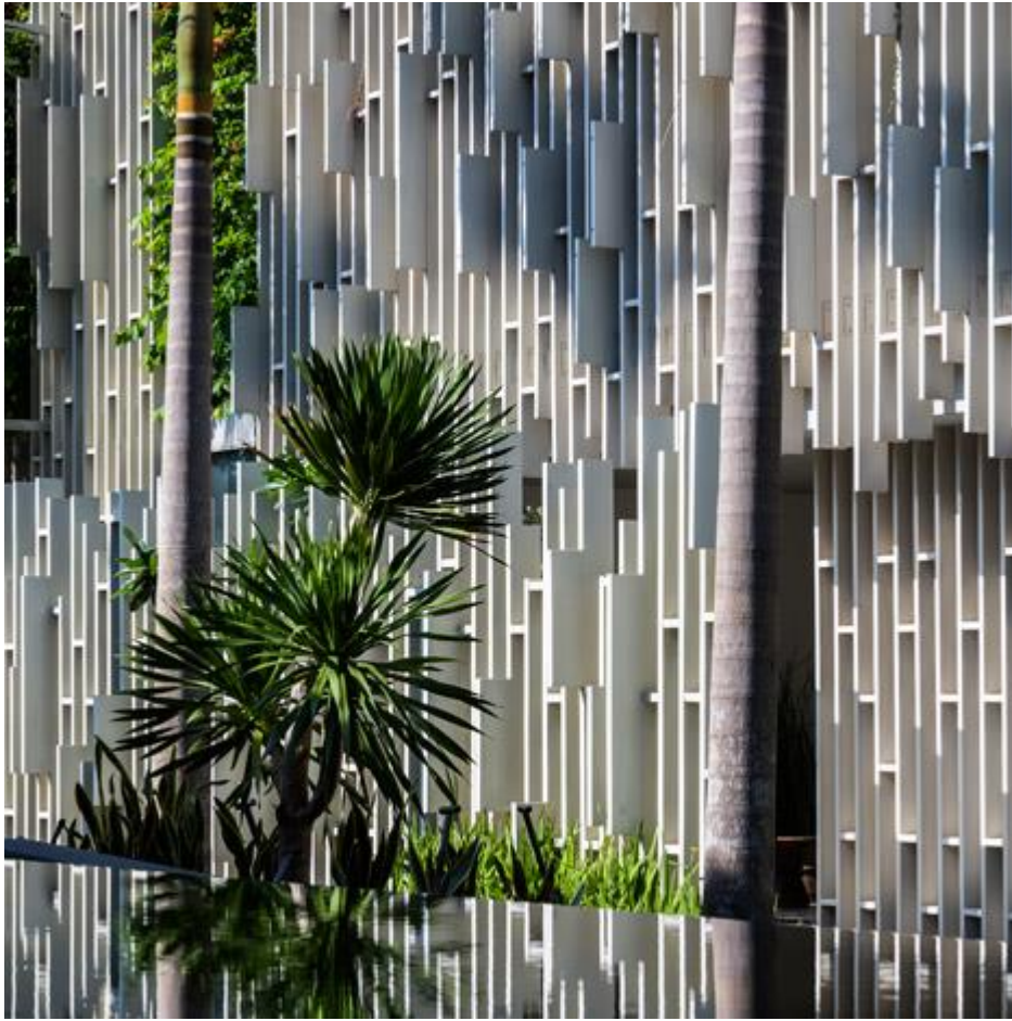
Naman Retreat Pure Spa, Da Nang, Vietnam, by MIA Design Studio