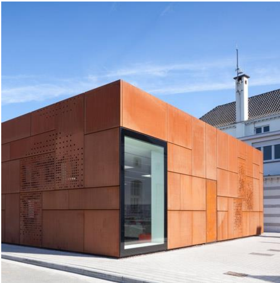
City Library, Bruges, Belgium, by Studio Farris Architects