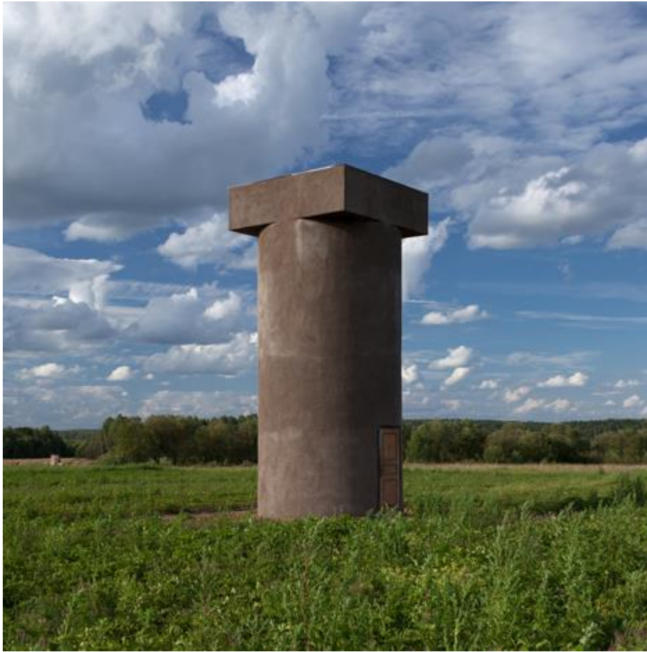
Museum for Rural Labour, Zvizzhi, Russia, by Sergei Tchoban and Agniya Sterligova