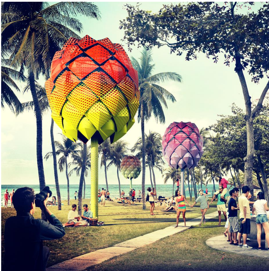
Beach Hut, Singapore, by Spark