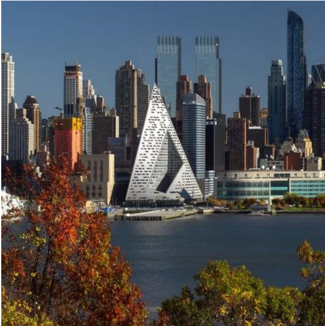
Via 57 West, New York, USA, by BIG