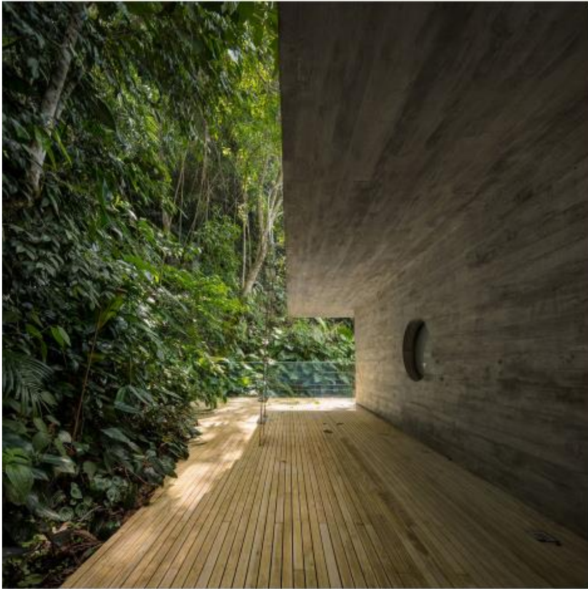
Jungle House, Guarujá, São Paulo, Brazil, by Studio MK27

Other firms to make this year's list include Norwegian studio Reiulf Ramstad Architects, Istanbul-based Emre Arolat Architects, Brazilian office Studio MK27, London-based CRAB Studio and Shanghai studio Neri&Hu.