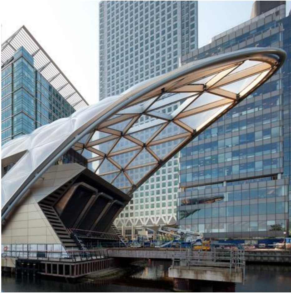
Crossrail Place, Canary Wharf, London, United Kingdom, by Foster and Partners