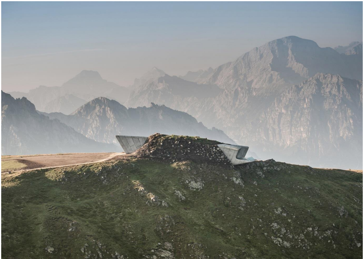
Messner Mountain Museum, Corones, Kronplatz, South Tyrol, Italy, by Zaha Hadid Architects