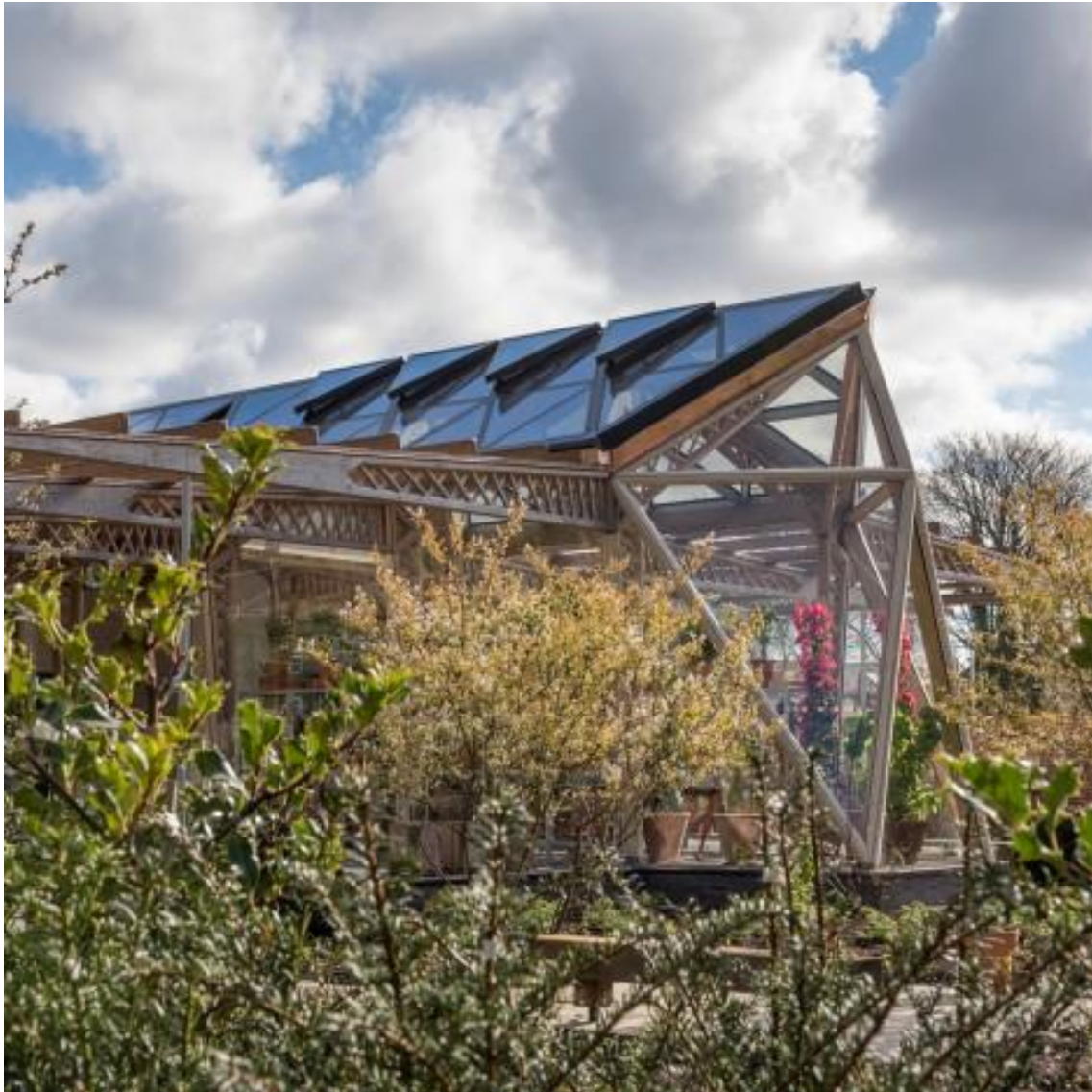
Maggie's at the Robert Parfett Building, Manchester, United Kingdom, by Foster and Partners