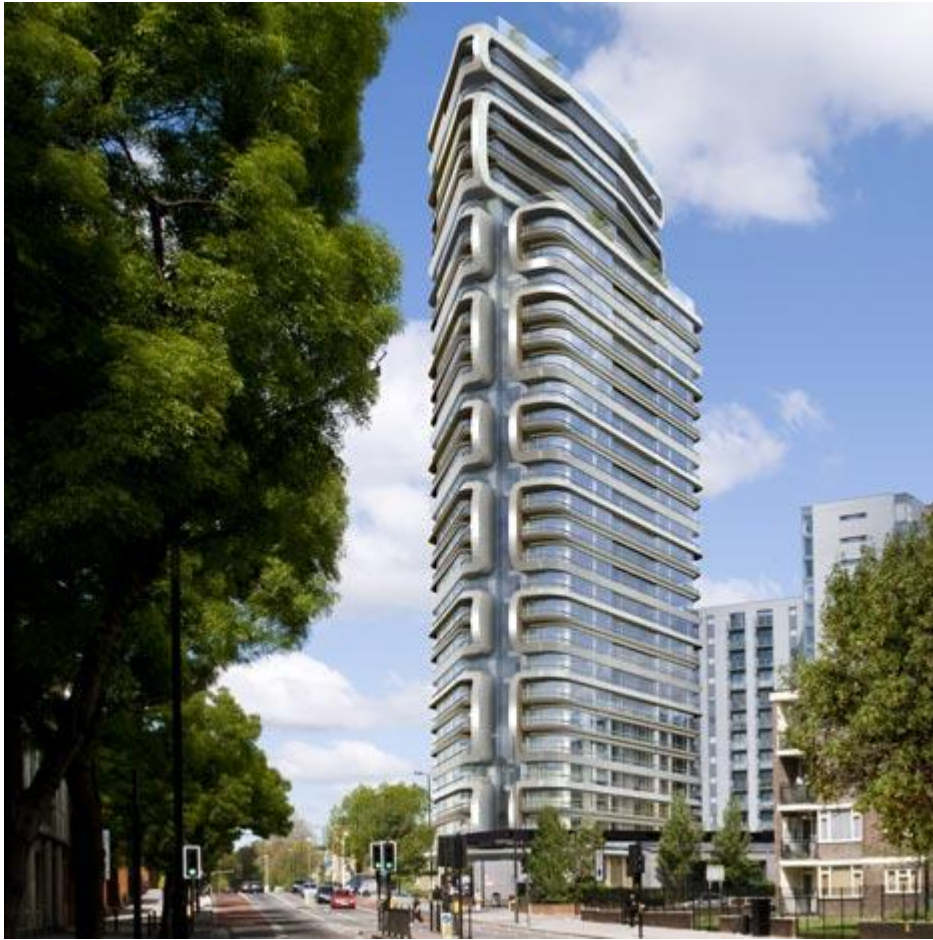
Canaletto, London, UK, by UNStudio