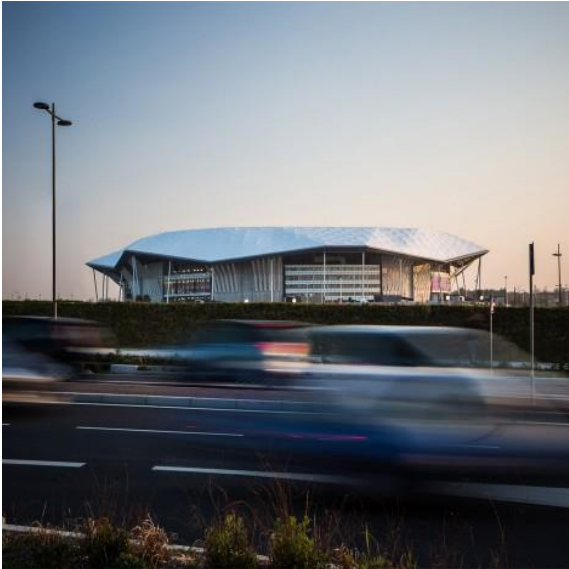
Parc Olympique Lyonnais, Lyon, France, by Populous