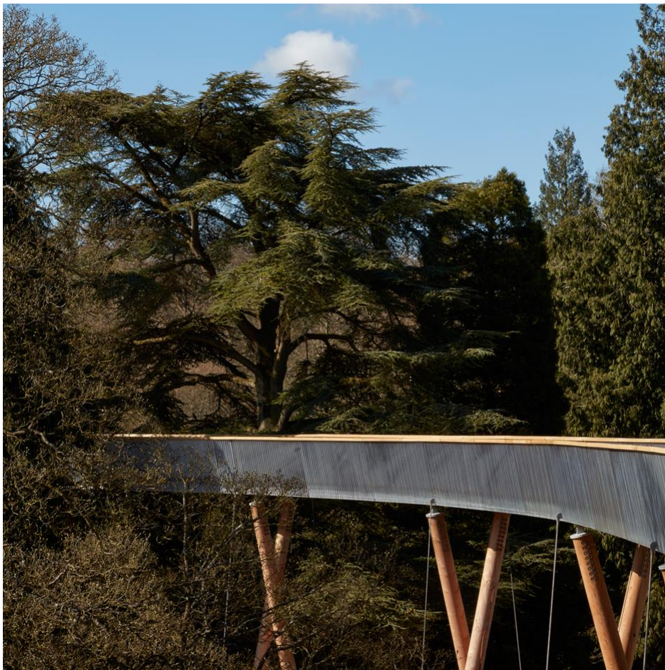
Stihl Treetop Walkway, Gloucester, United Kingdom, by Glen Howells Architects