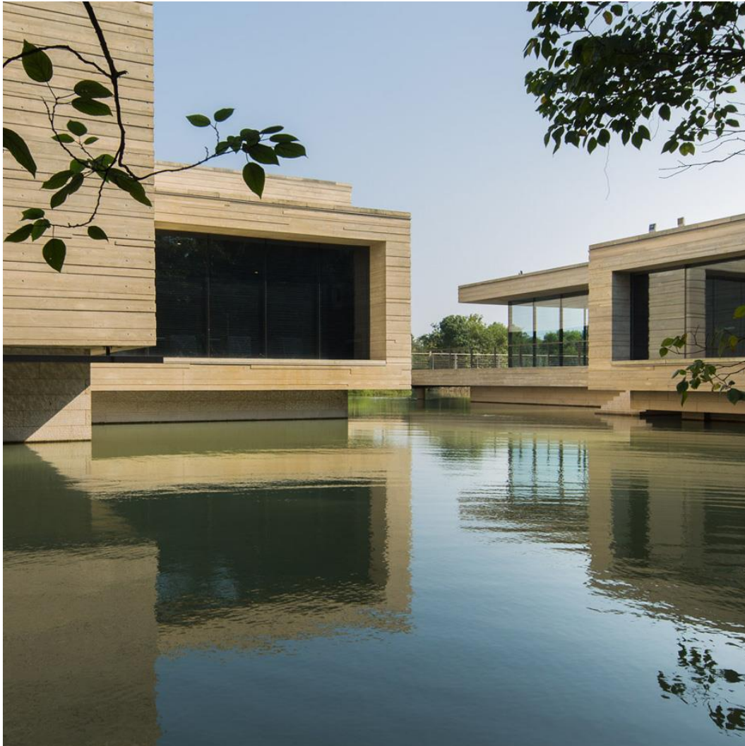
Mu Xin Art Museum, Wuzhen, China, by OLI Architecture