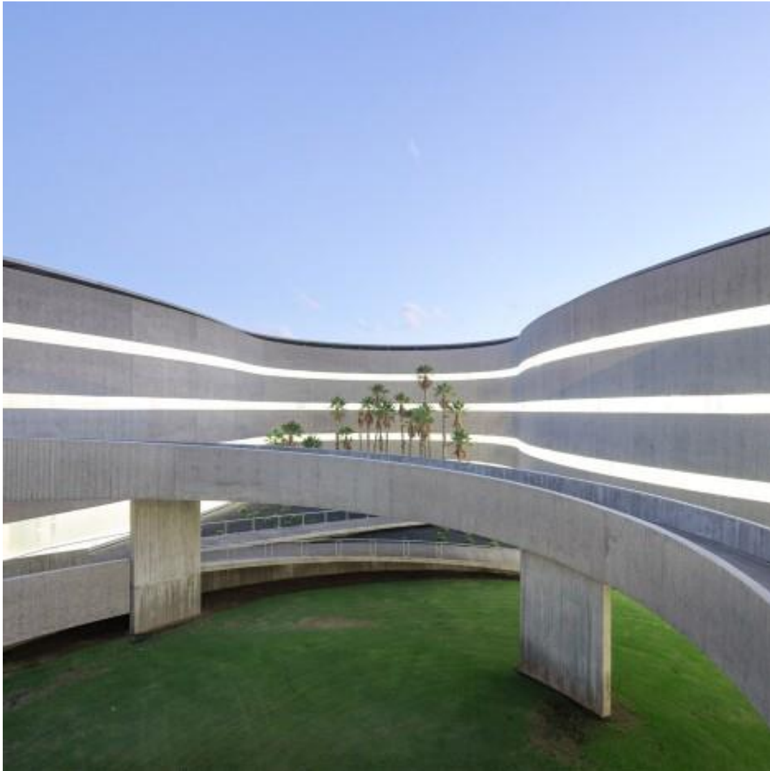
Faculty of Fine Arts, University of La Laguna, La Laguna, Spain, by GPY Arquitectos