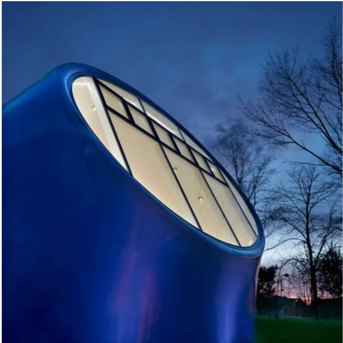
Drawing Studio, Poole, United Kingdom, by Crab Studio

Last year the World Building of the Year award went to The Interlace, the "vertical village" designed by Buro Ole Scheeren.